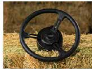
eDriveESi 2 ELECTRIC WHEEL