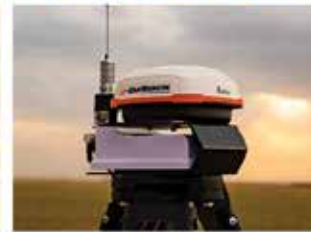
A631 SMART ANTENNA

As our return of investment graphic demonstrates, adding an Outback Guidance Maverix system and receiving a modest 3% improvement in error will easily return the costs of the system in the very first season of use. This does not even consider additional benefits of the system like reduced operator fatigue, which allows for a more comfortable season in the field and increased working hours. But these benefits are also expected to impact the bottom line of the crop production process.