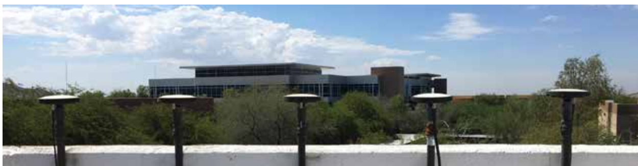
Figure 5: Open sky environment test location.

In a surprising twist, the test was repeated using a 0.5 m (19.7 inch) separation, and results were notably closer to published values, seeing an average of about 3 times worse than their respective specifications. Having both antennas closer to the center of the vehicle's roof provides a similar multipath environment for the antennas which improves their heading results. This shows having the antennas at their furthest point does not always translate to optimal performance. Having the best