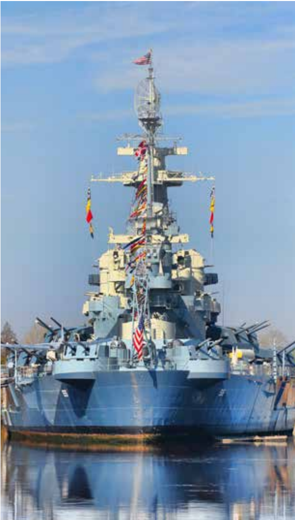
Figure 12: Large antenna masts have their place in history.

When you are faced with selecting a heading solution for your next integration, consider all the factors, and understand the importance of antenna placement. Don't get caught with a product which only meets your performance targets in open sky conditions. Similarly, pay attention to how far apart you can comfortably put the antennas, and how similar their multipath environments will be. There are a lot of tough questions to answer, but the clear solution is to select the GNSS heading devices which provide the best performance in the most compact package, select Hemisphere.