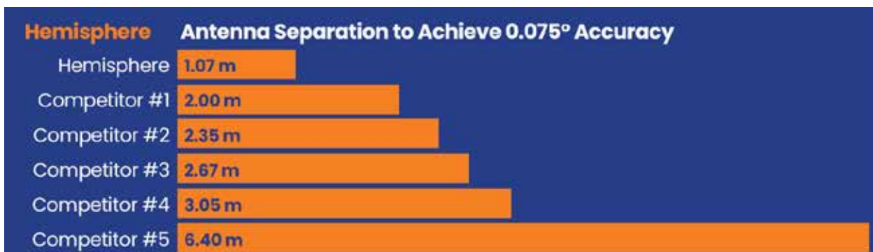
Figure 2: Antenna separations for various receivers at 0.075° heading accuracy.

There is a remarkable difference from 1.07 meters (42 inches), with several choices in the 2-to-3-meter range (79 to 120 inches), out to a massive 6.4 meters (252 inches, or 21 feet).