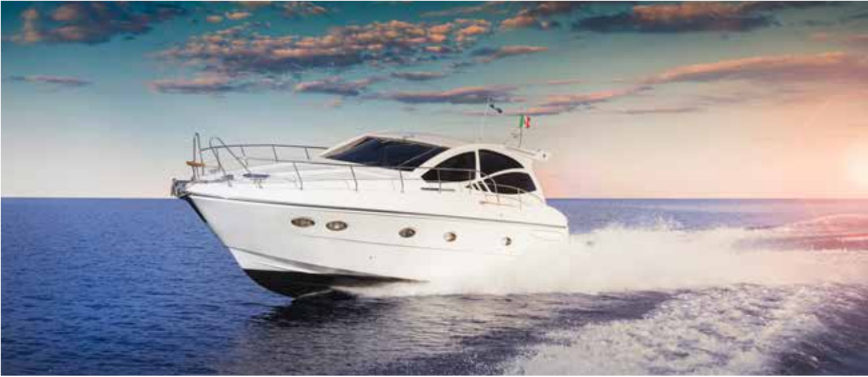
Figure 11: Clean lines highlight characteristics of the vessel's design.