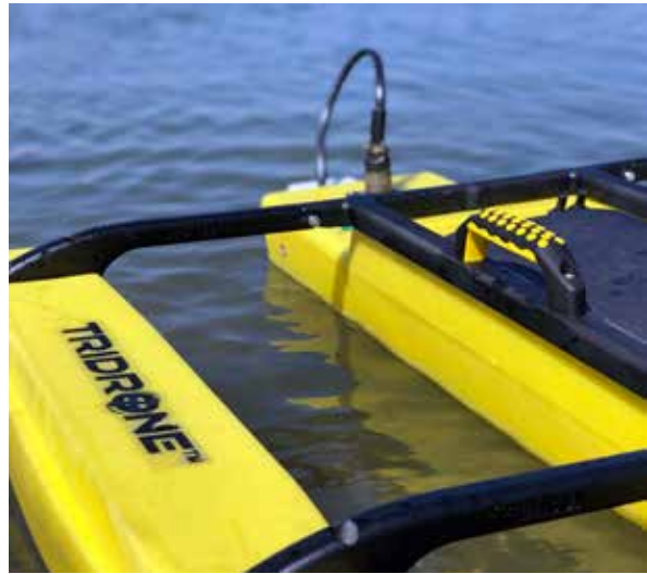
Figure 7: Shallow water hydrographic equipment.

Shallow water hydrographic equipment does not have room for large antenna separations. The platform limits how far apart the antennas can be. With autonomous vehicles of all descriptions for land, air, and on water, keeping things compact is essential to achieving efficiency. The IoT and scientific instruments market also