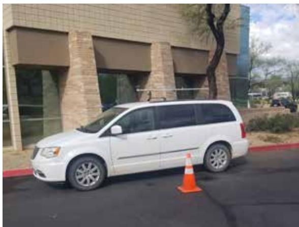
Figure 4: High multipath 2.0 m heading test.

Clearly, there is a significant advantage to selecting Hemisphere's Vega heading technology.