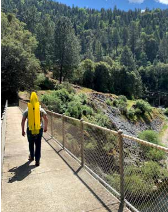
Figure 9: Obvious advantage for short antenna separations.

cannot afford poor heading performance, nor large platform designs.