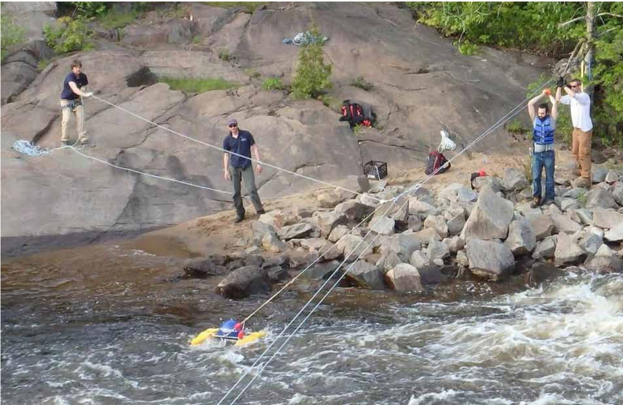
Figure 8: Many applications require compact antenna installations.