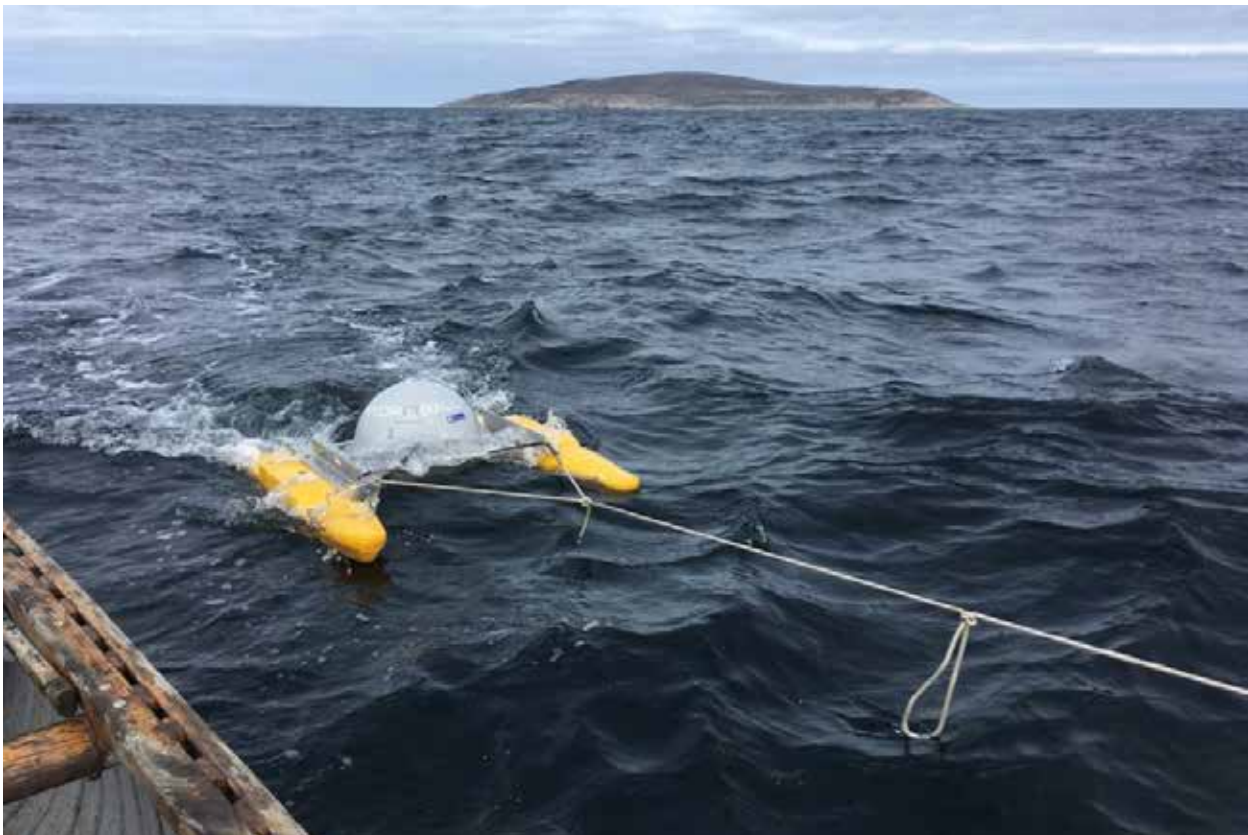
Figure 10: Applications with scientific equipment often have constrained antenna placement opportunities.

Through precise and careful engineering, Hemisphere's all-in-one V200 series heading antennas can even provide a reliable solution with just 0.2 meters (7.9 inches) separation. The entire receiver and combined antenna housing measures only 35 by 16 cm (13.7 by 6.2 inches). This compact solution provides 0.75° heading accuracy and is available in either serial or NMEA2000 formats.