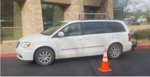
Figure 6: High multipath 0.5 m heading test.

available performance for a given antenna separation is again an advantage, allowing integrators to find the optimal installation point for their application.